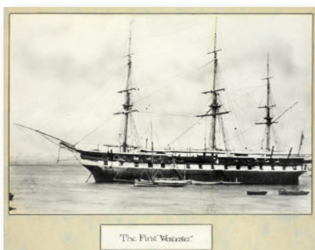
Worcester I 1862-77

Lastly the programme allows you to select and book individual events or take part in the full programme. A 2012 website, whose details are at the bottom of the page, is now active and ongoing and will include further details as we get closer to the event. An up to date list of attendees will also be added and updated early in 2012.