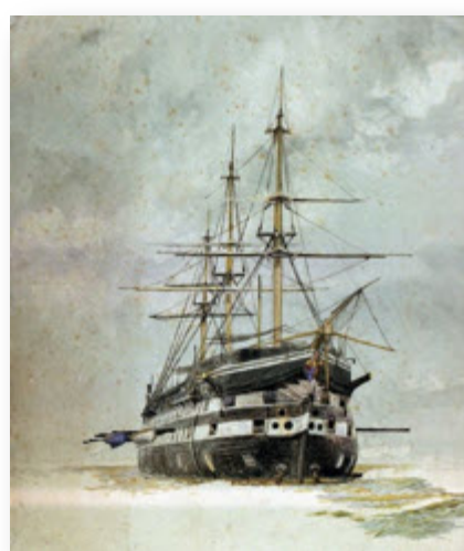
Worcester II 1877-1946