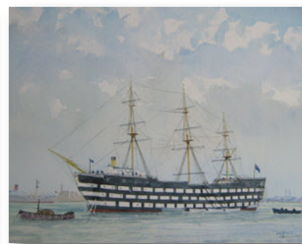
Worcester III 1946-68