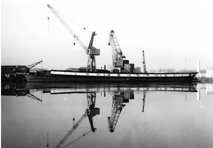
Nearly gone – in Bruges